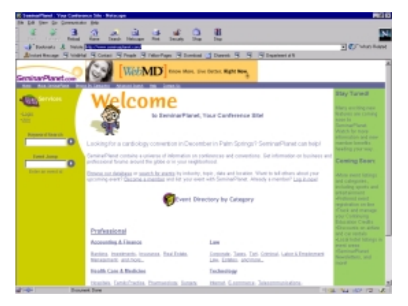
Figure 1: Phase One of the SeminarPlanet solution: An easy-to-use Web-based interface.

Given the size of this domain, an enterprisestrength database was needed—Oracle 8i was chosen to fulfill that requirement. Above the Oracle tables. PowerVision engineers employed a custom combination of code generation and hand